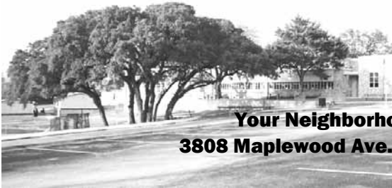
Your Neighborhood School 3808 Maplewood Ave., 414-4402

"Today, education is perhaps the most important function of state and local governments. Compulsory school attendance laws and the great expenditures for education both demonstrate our recognition of the importance of education to our democratic society. It is required in the performance of our most basic public responsibilities. ... It is the very foundation of good citizenship. Today, it is a principal instrument in awakening the child to cultural values..." — Supreme Court of the United States, Brown v. Board of Education , 1954.