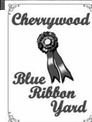
Patti and Joe at 4007 Crescent take the prize for their landscaping.